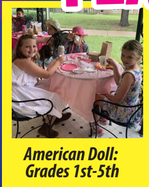
American Doll: Grades 1st-5th